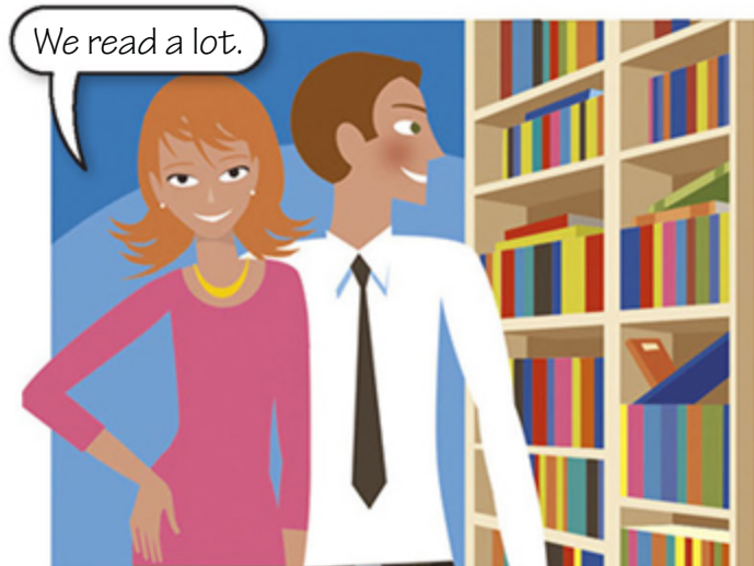
They have a lot of books. They read a lot.